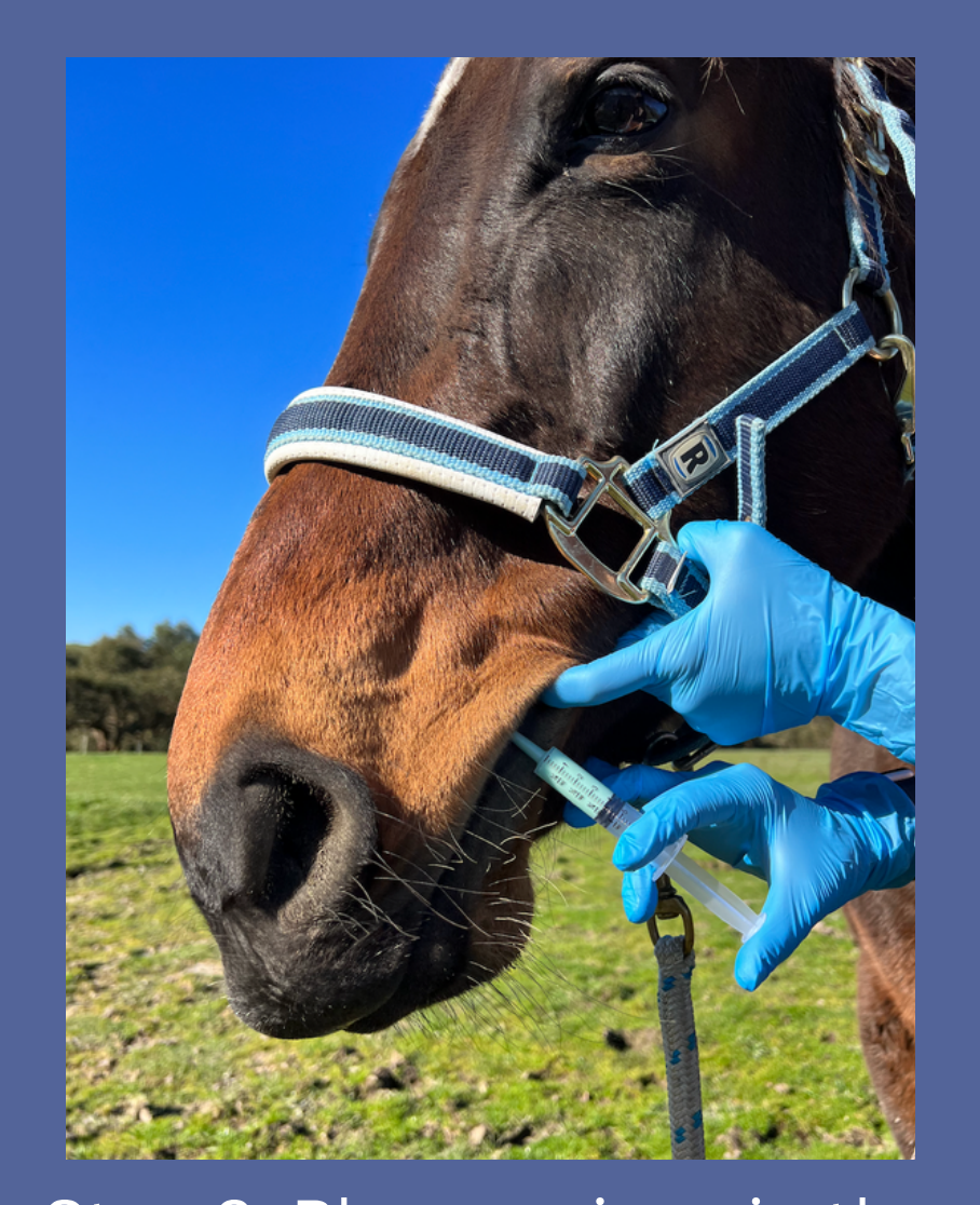
Step 3: Place syringe in the corner of mouth and administer the oral medication by aiming to the back of their mouth