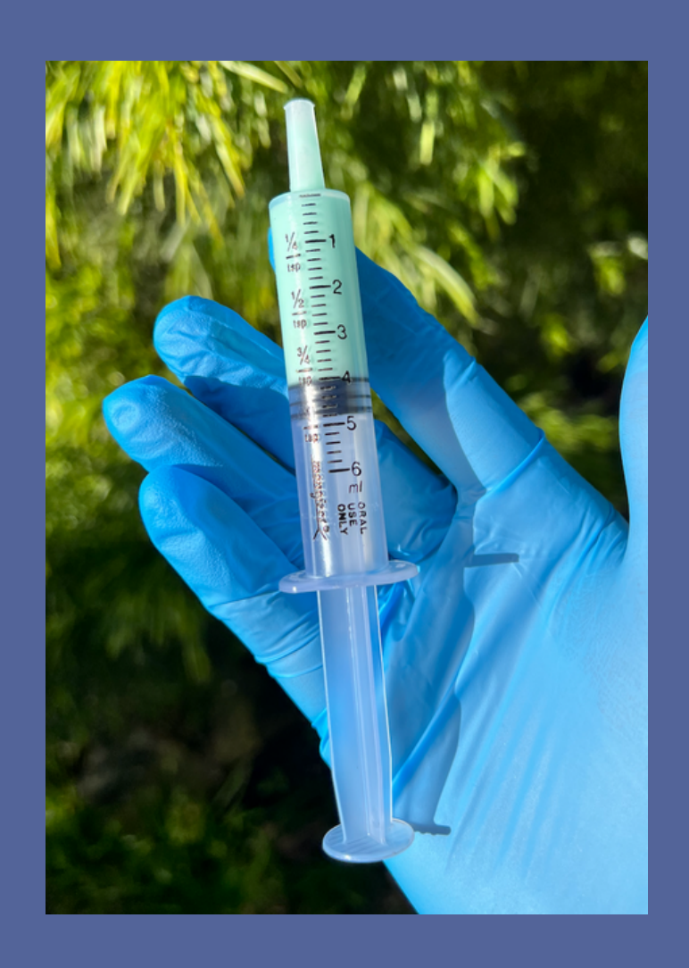
Step 1: Draw up the correct volume of medication