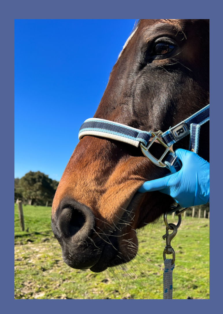
Step 2: Confirm location to administer medication