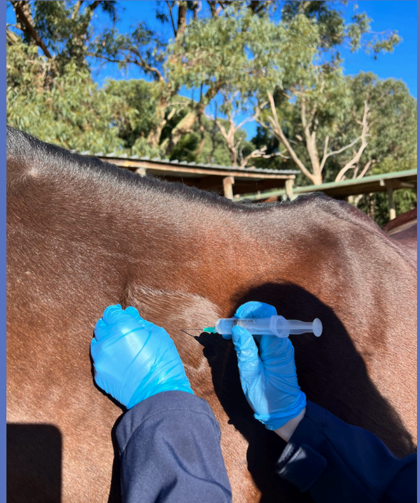
Step 5: Insert the needle into the muscle perpendicular to the neck