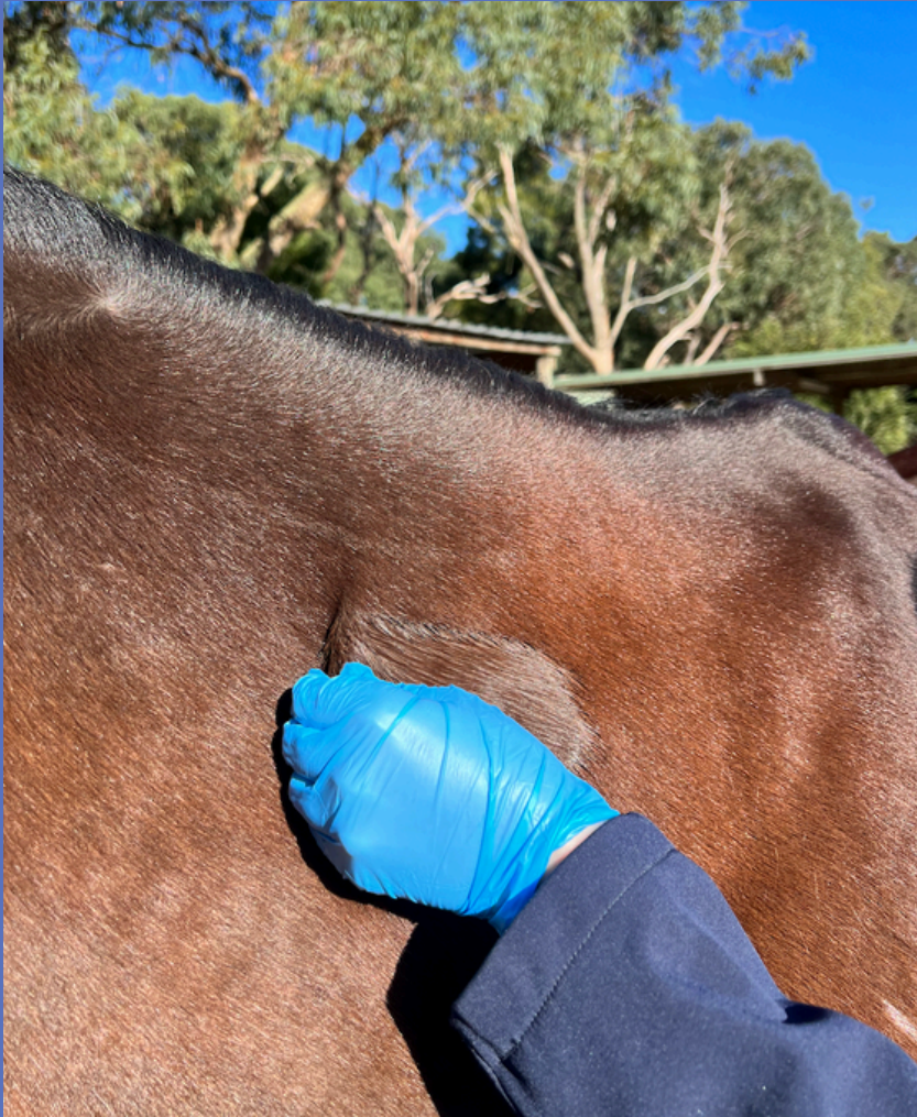
Step 4: Grab a small amount of skin as a distraction